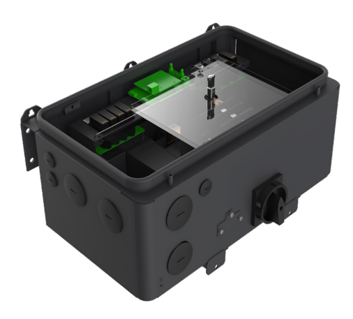
100/125KTL Centralized Wire-box

© CHINT POWER SYSTEMS AMERICA 2021/10-MKT NA