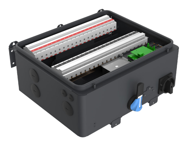
100/125KTL Standard Wire-box